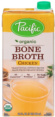
PACIFIC BONE BROTH