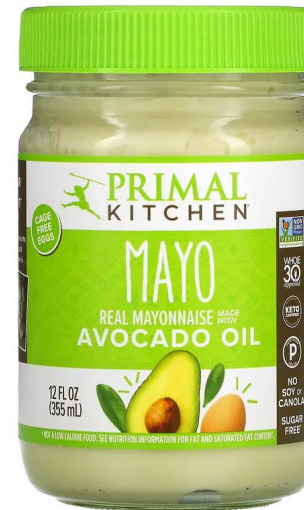
PRIMAL DRESSING MAYONNAISE