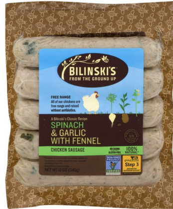
BILINSKI'S CHICKEN SAUSAGE