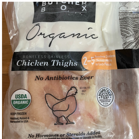
BUTCHER BOX CHICKEN