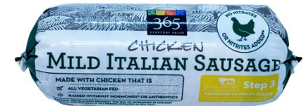
WHOLE FOOD ITALIAN SAUSAGE