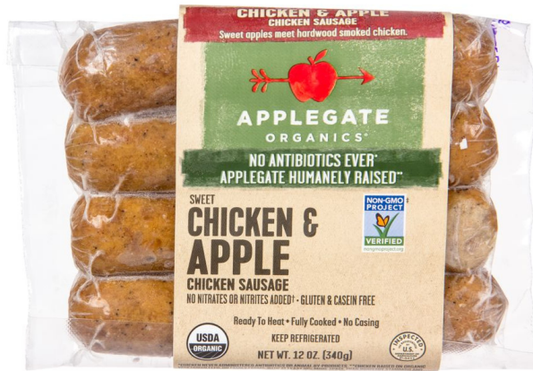
APPLEGATE CHICKEN SAUSAGE