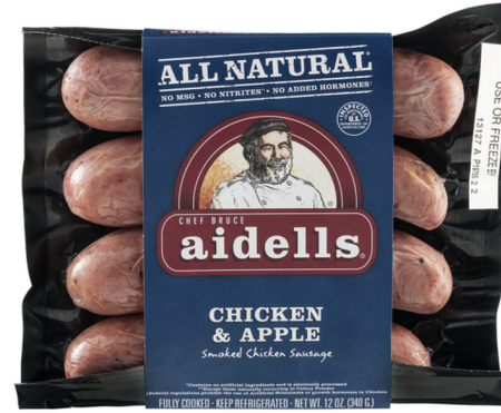
AIDELLS CHICKEN SAUSAGE