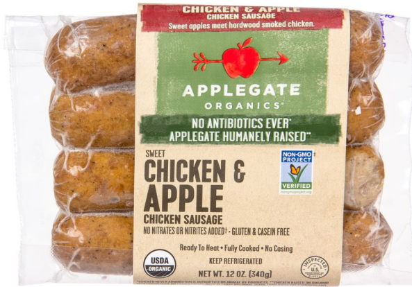
APPLEGATE CHICKEN SAUSAGE