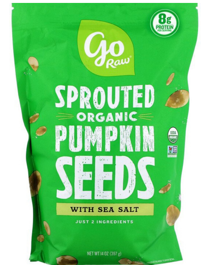
SPROUTED SEEDS 25