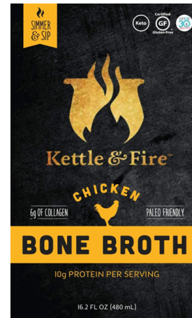
KETTLE & FIRE BONE BROTH