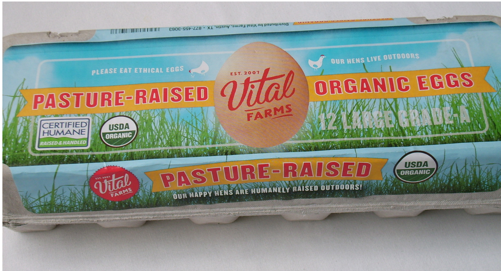
PASTURE - RAISED ORGANIC EGGS