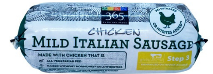
WHOLE FOOD ITALIAN SAUSAGE