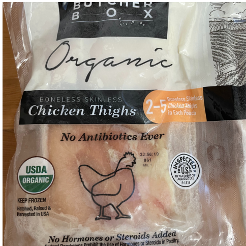
BUTCHER BOX CHICKEN