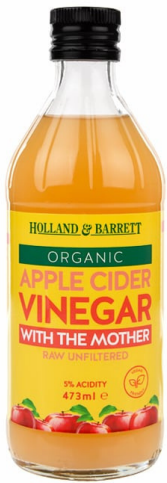
APPLE CIDER VINEGAR