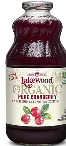
LAKWOOD CRANBERRY JUICE