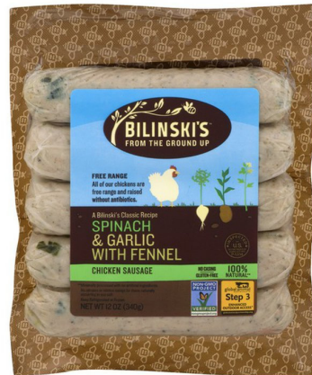
BILINSKI'S CHICKEN SAUSAGE