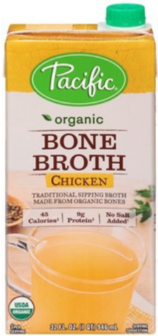
PACIFIC BONE BROTH