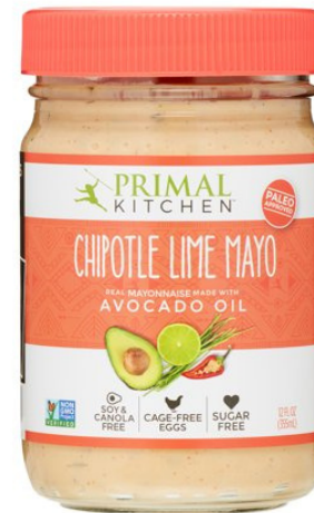
PRIMAL DRESSING MAYONNAISE