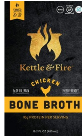
KETTLE & FIRE BONE BROTH