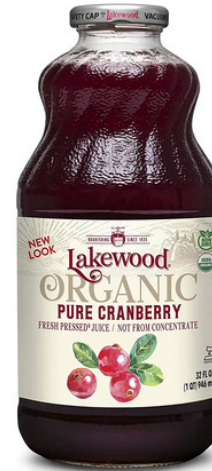
LAKWOOD CRANBERRY JUICE