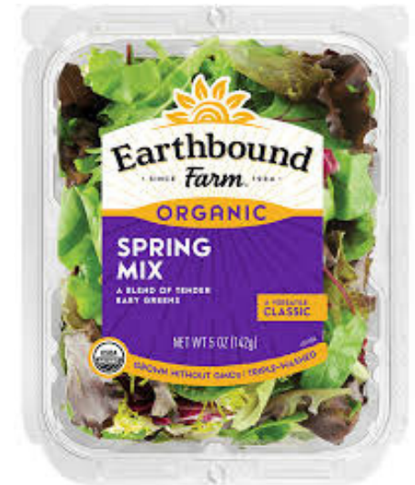
SALAD SPRING MIX