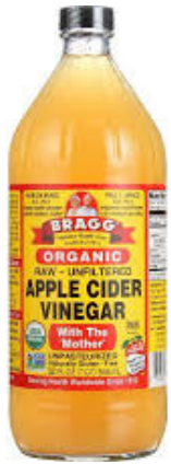
APPLE CIDER VINEGAR