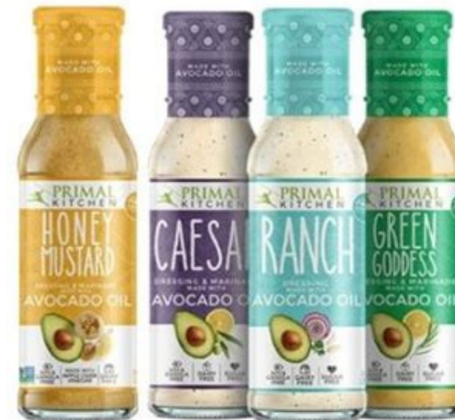
PRIMAL KITCHEN DRESSINGS