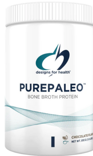
CHOCOLATE BONE BROTH POWDER